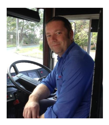
We left a message on the gate and headed off to Puppeteria in Castle Cove on the bus. The driver of our bus was called Cameron. He was friendly and helpful.