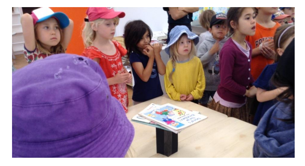
We shall be visiting Group 1 over the next couple of weeks.

We also observed a scientific experiment which involved the children hypothesising which was stronger - a paper cylinder or paper cuboid.