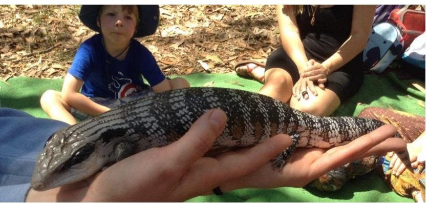
We went on a Community bus to the Wildflower Garden in St Ives. We looked at a turtle, some stick insects, a blue tongued lizard and an echidna which was not alive.