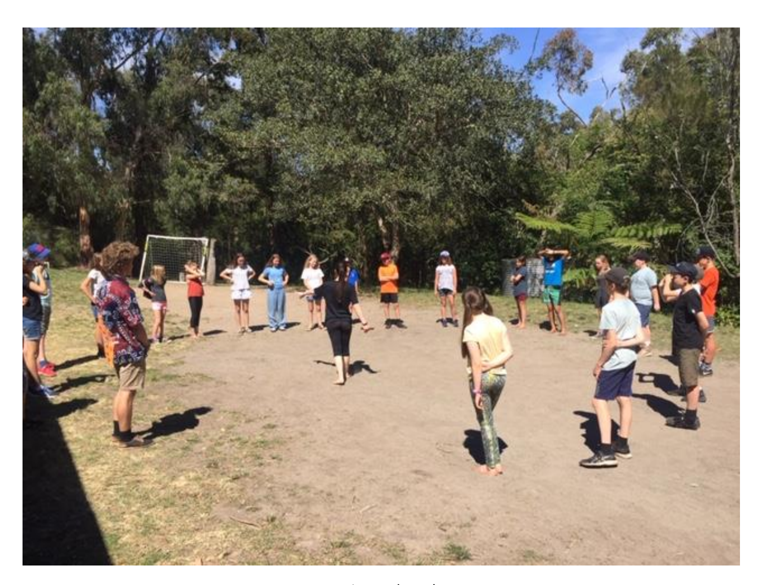
Preparing to dance!