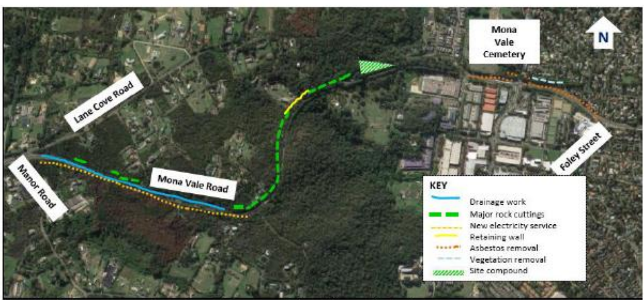
Note: Shaded areas are not to scale and for general information and illustrative purposes only