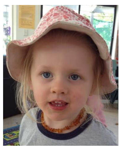
AT THE CRAFT TABLE.....

"You know scissors can cut metal? Not all metal."