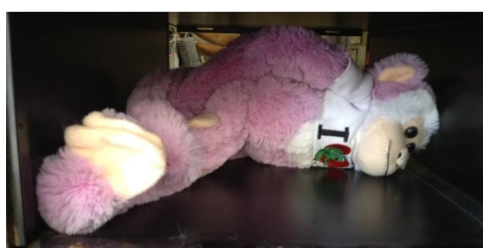
We put the letters in Kay's backpack and after we had all said hello, put the monkey back in the box. We also posted a letter for a lady who walked past.

Then we headed back to Preschool. We crossed the roads very carefully. It was a long way and we saw interesting things including a tree that looked like a pineapple and three horses.