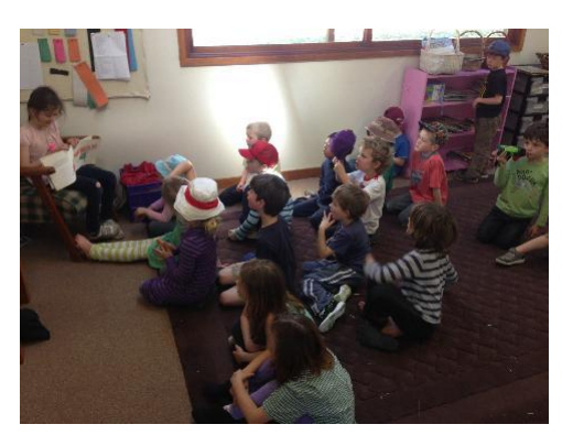
Reading a very funny story about a dancing bear to the children.