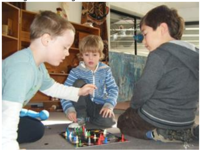
Conversation/asking questions/discussion Providing a good role model Giving back correct grammatical form e.g. buyed/bought quicklier/quickly Lots of play – dramatic play

Oral language rich environment Talking and listening