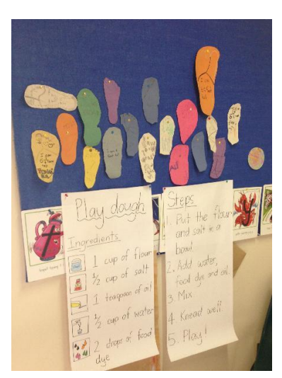
In literacy we have been writing up the procedure for making Play-Doh, whilst Andy's group have been concentrating on handwriting through creative stories. In maths we have been measuring using our feet and finding out that we all have very different sized feet!

Our week has been full of songs, stories and numbers and with just 2 weeks left, we are packing it in.