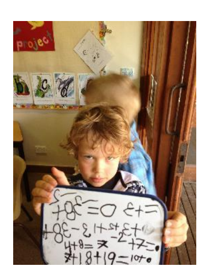
Making sense using maths...